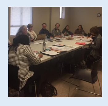
New Partners Welcome!

We meet the first Monday of each month at 3:30 pm at Tehama County Health Services Agency-Substance Use Recovery Services 1850 Walnut St., Bldg. G Antelope Creek Room Red Bluff, CA 96080